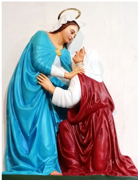
Bishop Allwyn Dsilva unveiled the life size statue of the Visitation on 5th September 2022